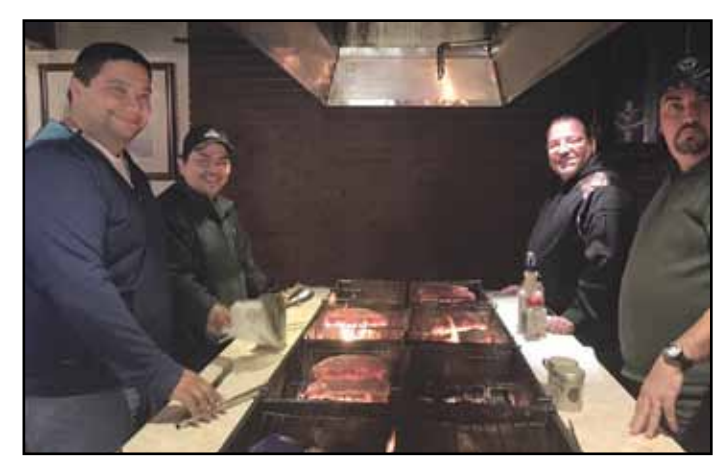
FDL officers pose for a picture on appreciation night.

Thank you for your continued hard work and dedication to your department and your community.