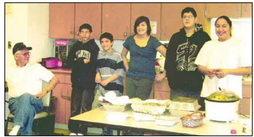
Ojibwe School volunteers assist at spring breakfast benefit for FDL elders.