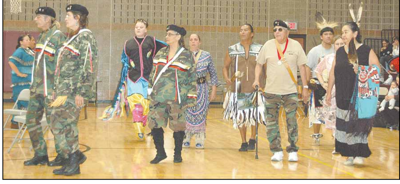
1854 Treaty Powwow at Sawyer, Sept. 26, 2009