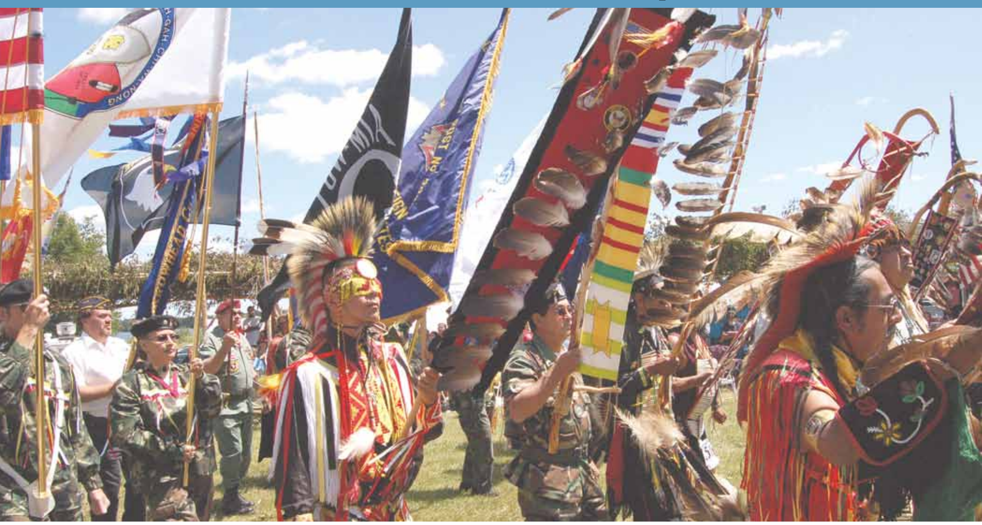
Grand Entry, Mash ka wisen Treatment Center Powwow, Aug. 1-2, 2009