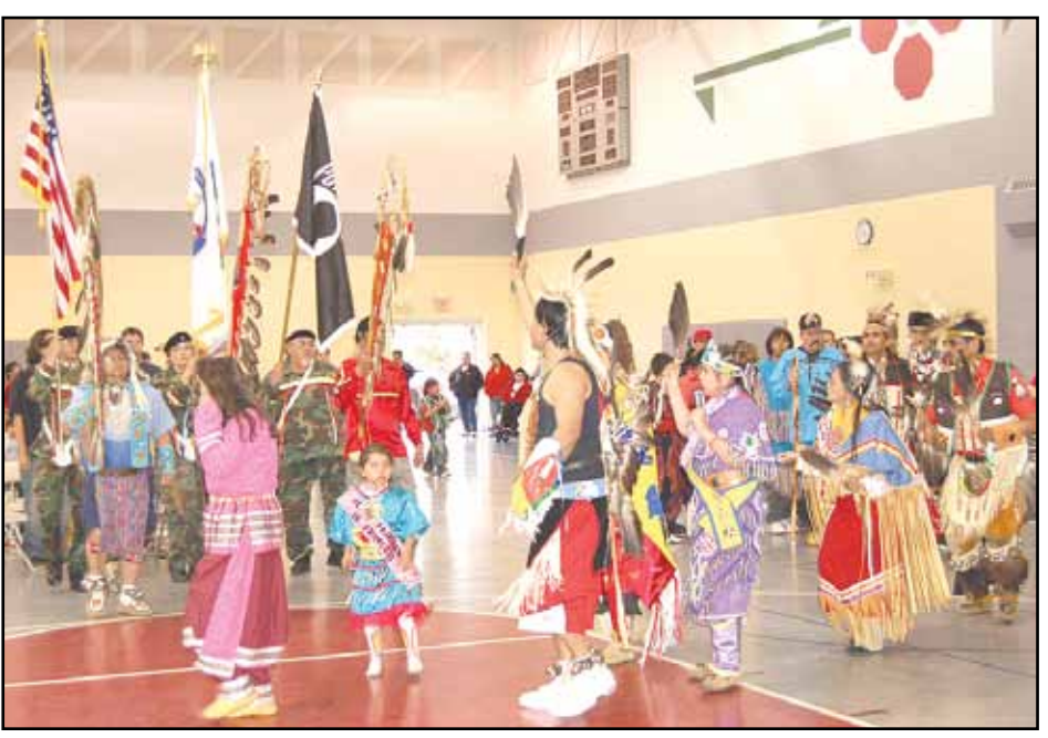
District I (Cloquet) Powwow, May 9, 2009