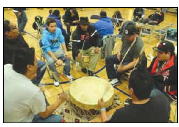
Lake Vermillion singers