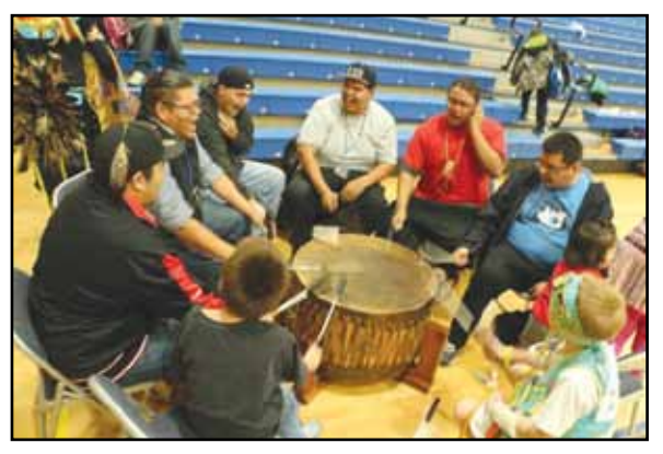
FDL Ojibwe School singers