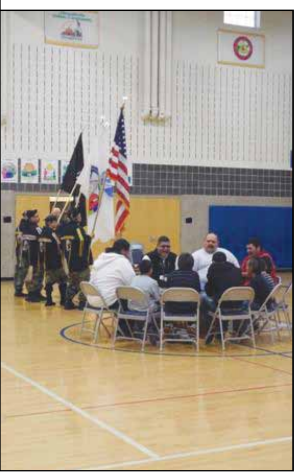
FDL Ojibwe School Drum and FDL Honor Guard