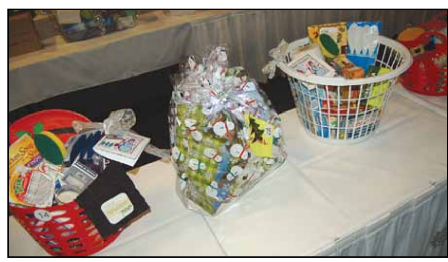
Some of the baskets full of practical and fun gifts.