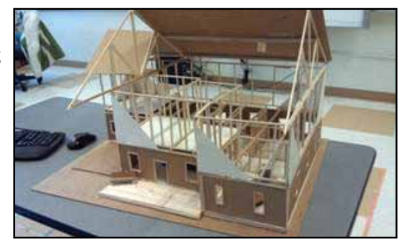
The model house seniors are working on as part of their math curriculum.

skills throughout the years. Focusing on the big ideas of mathematics, Connecting Math Concepts teaches explicit strategies that enable students to master difficult ideas such as ratios, proportions, probability, functions, and data analysis. Detailed explanations and guided practice move students toward independent work, ensuring that students gain success and confidence as mathematical thinkers. For more information about Connecting Math Concepts, please visit https://www.mheonline. com.