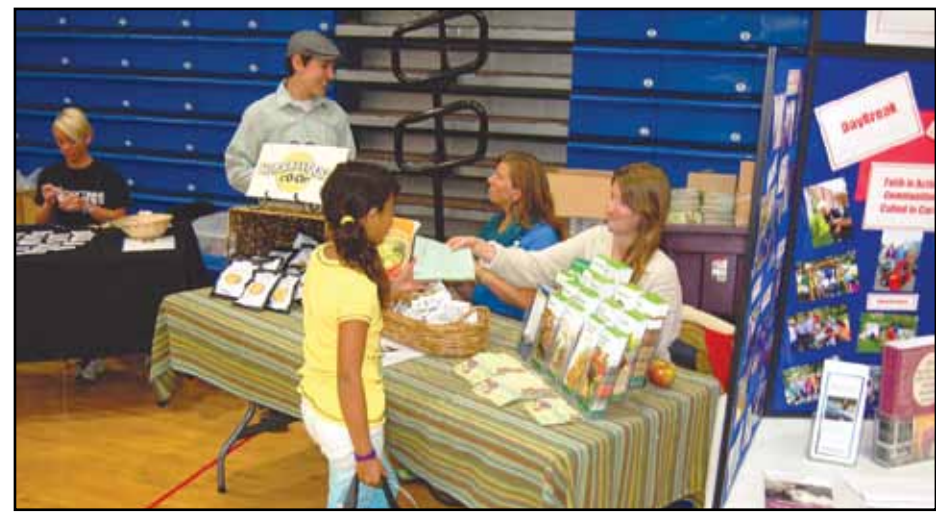
A chance for people of all ages to get more info on how they can be healthy.