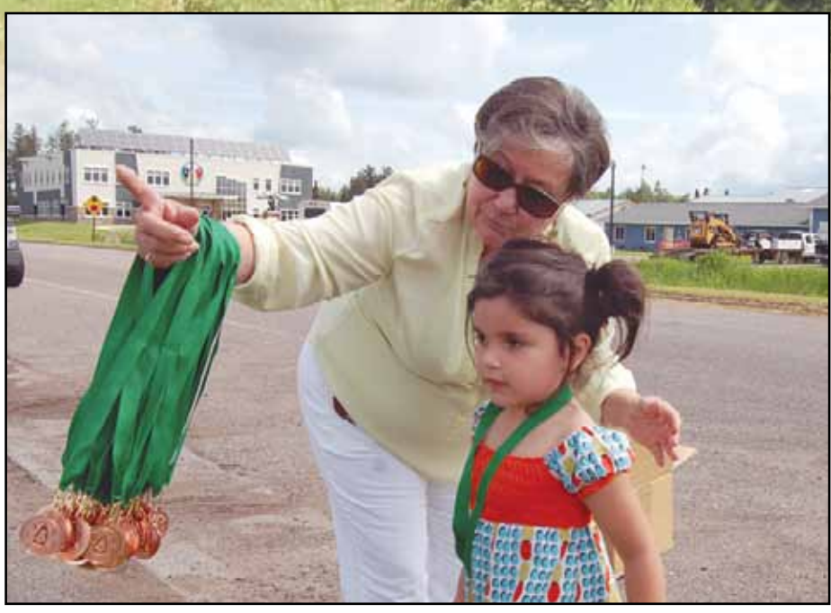
The finish line after the 2K/5K as this little girl receives her medal.

Left: The FDLTCC team during the AIHEC national basketball tournament.