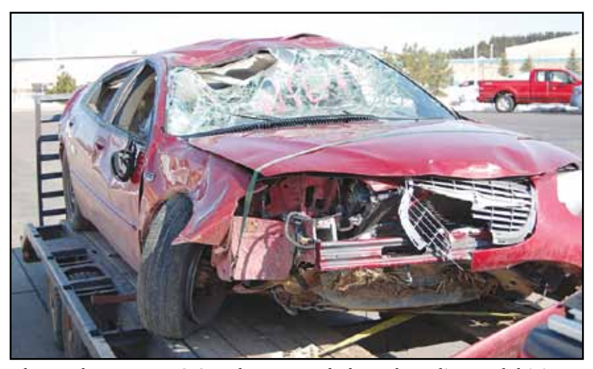
The car shown to FDLOJS students to teach them about distracted driving.