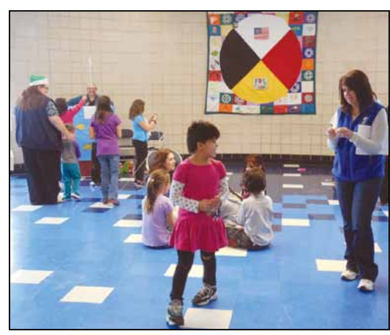
Children playing during the Biboon celebration on Dec. 19 at FDLOJS.

His passions in life were his family and the beauty of nature. He was most content when enjoying the great outdoors on the back of his horse, Deuce.