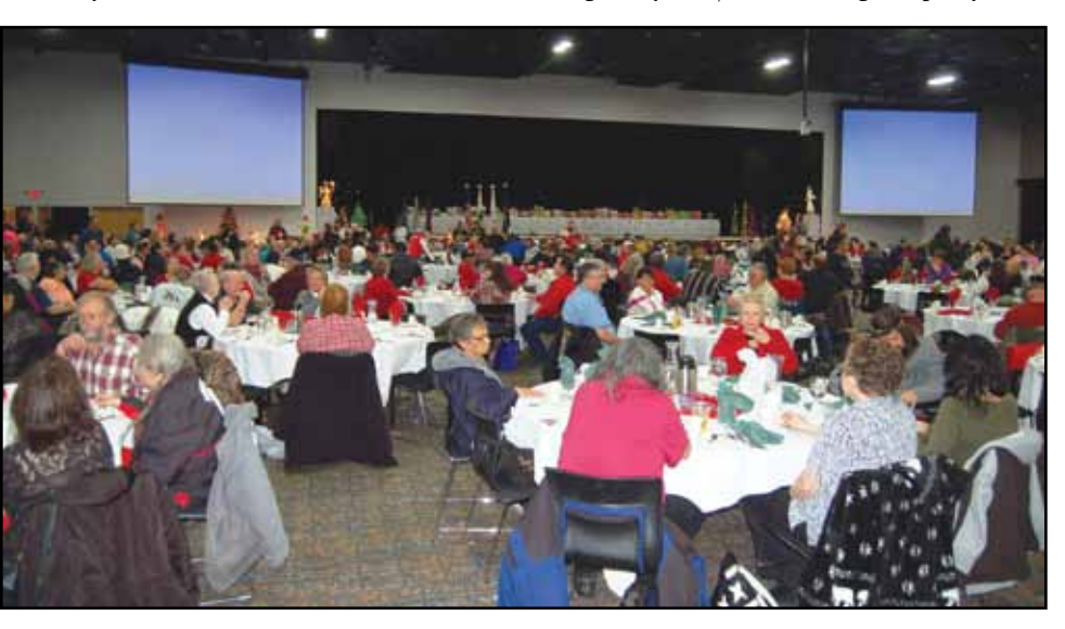
The crowd awaits for the volunteers to begin serving the meal at the Elder's Christmas party.