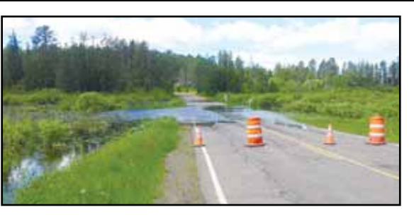
Stream flows over University road making travel impossible.

A shot in Duluth just hours after the storm and a great reminder of why we can't drive through even in bigger vehicles and also why we shouldn't swim in the overflow.