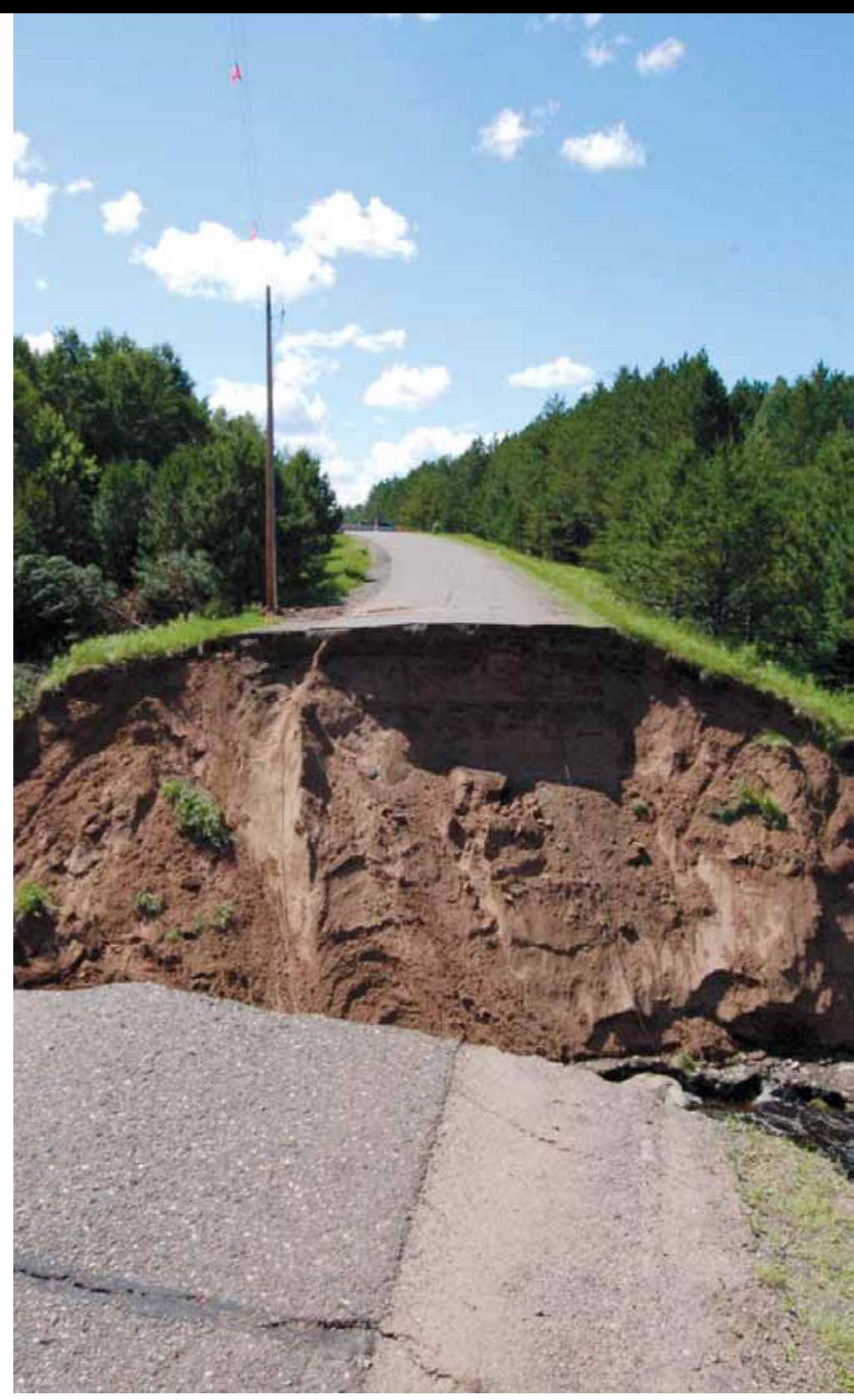
The damage on some parts of the Reservation were impressive as it swept away roads.