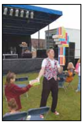
The entertainer borrowed one little girl from the audience as he worked to balance blocks from his chin, he was successful in doing so.