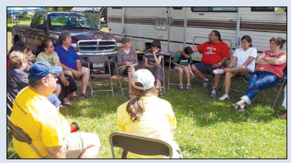
One of the groups discusses the different words for "hello" and where they're used.

But the camp was about more than words, as it was full of different activities for all the campers to enjoy. During the time that I stopped in, kids everywhere were playing in Big Lake, running around with friends, or sitting with adults in the groups discussing the language. One group, being led by a man and a woman, was asking others for questions about the language. Fielding different questions from "What are the different things that men and women say?" to "Why is a word so basic like 'hello' said in different ways?"