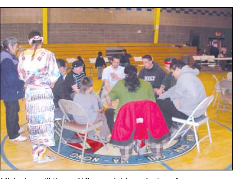
Miziwekaamiikiinaan-"All around this earth of ours".

Word list courtesy of Red Cliff Mino Bi Ma De Se Win