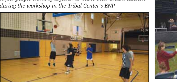
A shot during the basketball game as the one team tried to fight their way back into the game.