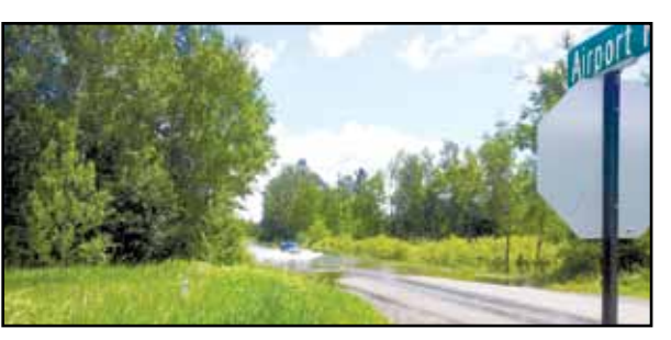
Car splashing through water on Airport Rd 24 hours after the devastating storm.