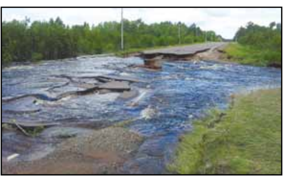
The intense destruction that mother nature had taken its toll on Brevator Rd.

Lakes and streams all across the area have flooded roads like Twin Lakes Rd.