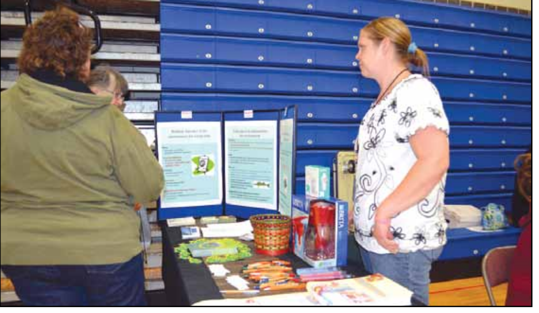
This booth taught attendees of the health fair about the dangerous chemicals that stay in the environment.