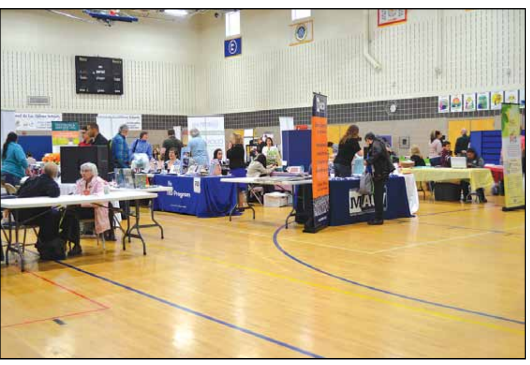
Just some of the informational booths during the 36th annual FDL health fair.